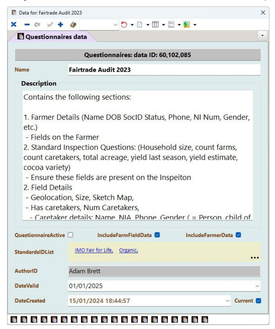
Questionnaires edit form

The image below shows the "Questionnaires" Edit Form. This is accessed via its own entry in the System Entities screen.